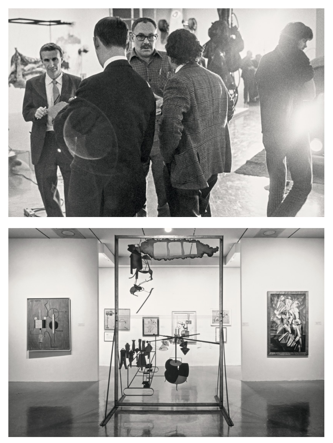
Above: Pontus Hultén in the exhibition The Machine , New York, 1968. Below: Marcel Duchamp, The Large Glass (1915–1923/1961) from the Moderna Museet collection in the same exhibition, 1968