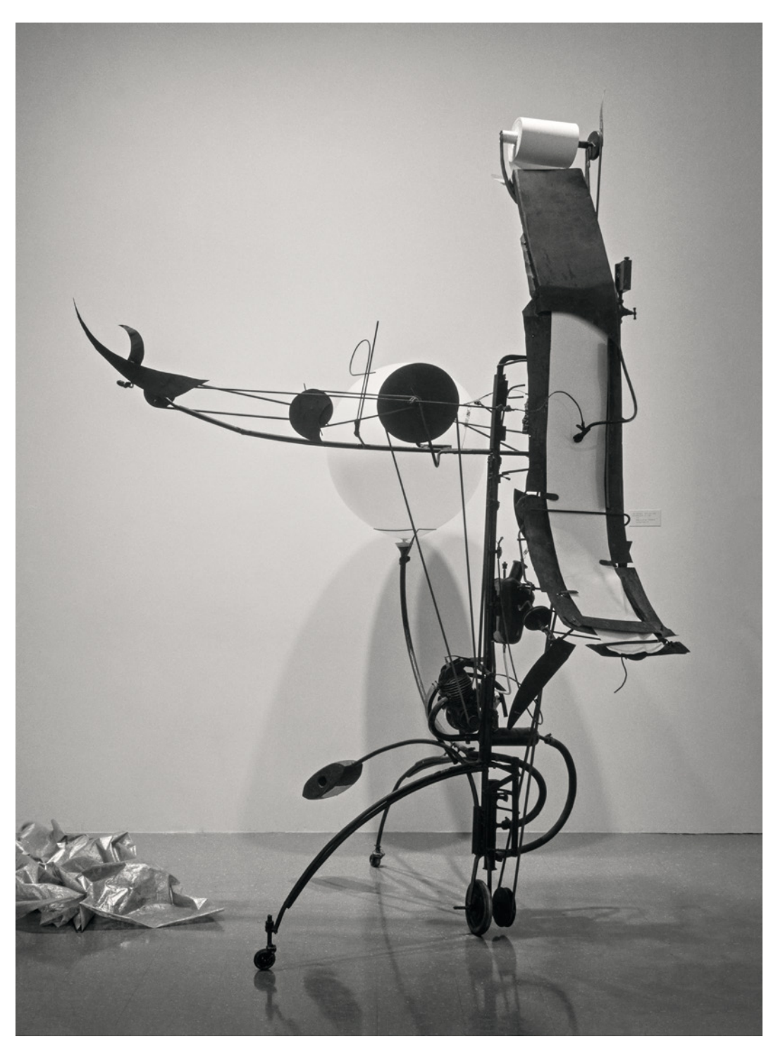
Jean Tinguely, Méta-Matic No 17 (1959) from the Moderna Museet collection, in the exhibition The Machine , The Museum of Modern Art, New York, 1968