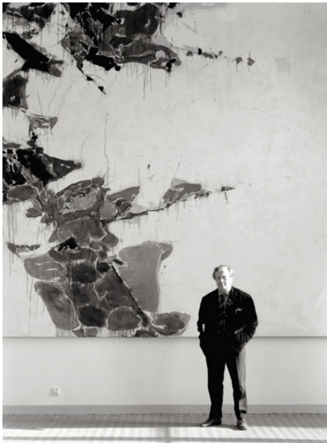
The artist Sam Francis in the exhibition, Moderna Museet, 1960