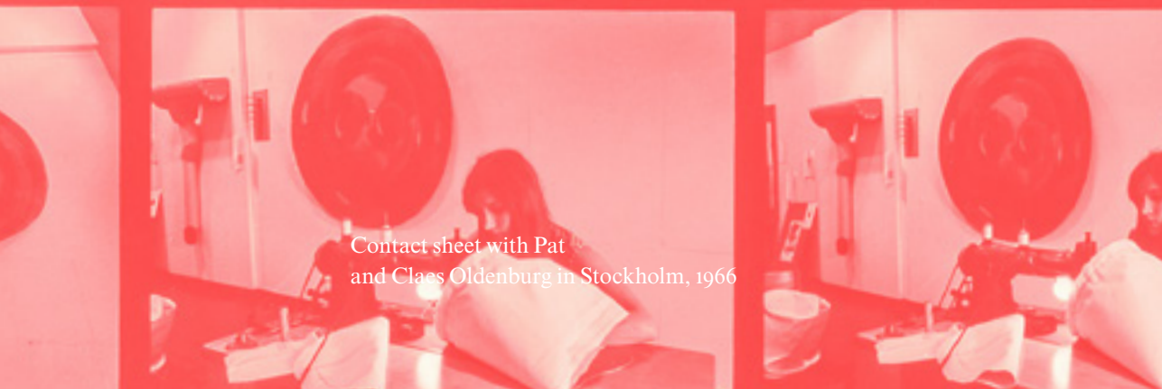
Contact sheet with Pat and Claes Oldenburg in Stockholm, 1966